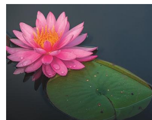
使用其他色彩控制方法的效果 Using other control method